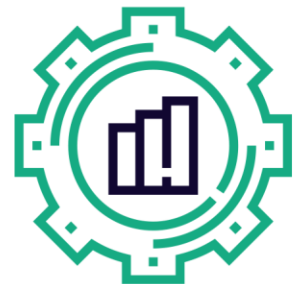
Performance Management Process