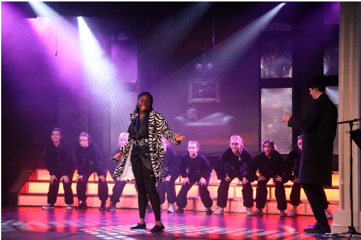
We Will Rock You, 2023. Years 7-12

We are currently reviewing the Sixth Form Curriculum, with a possibility of introducing the BTEC Level 3 Diploma in Performing Arts from September 2026.