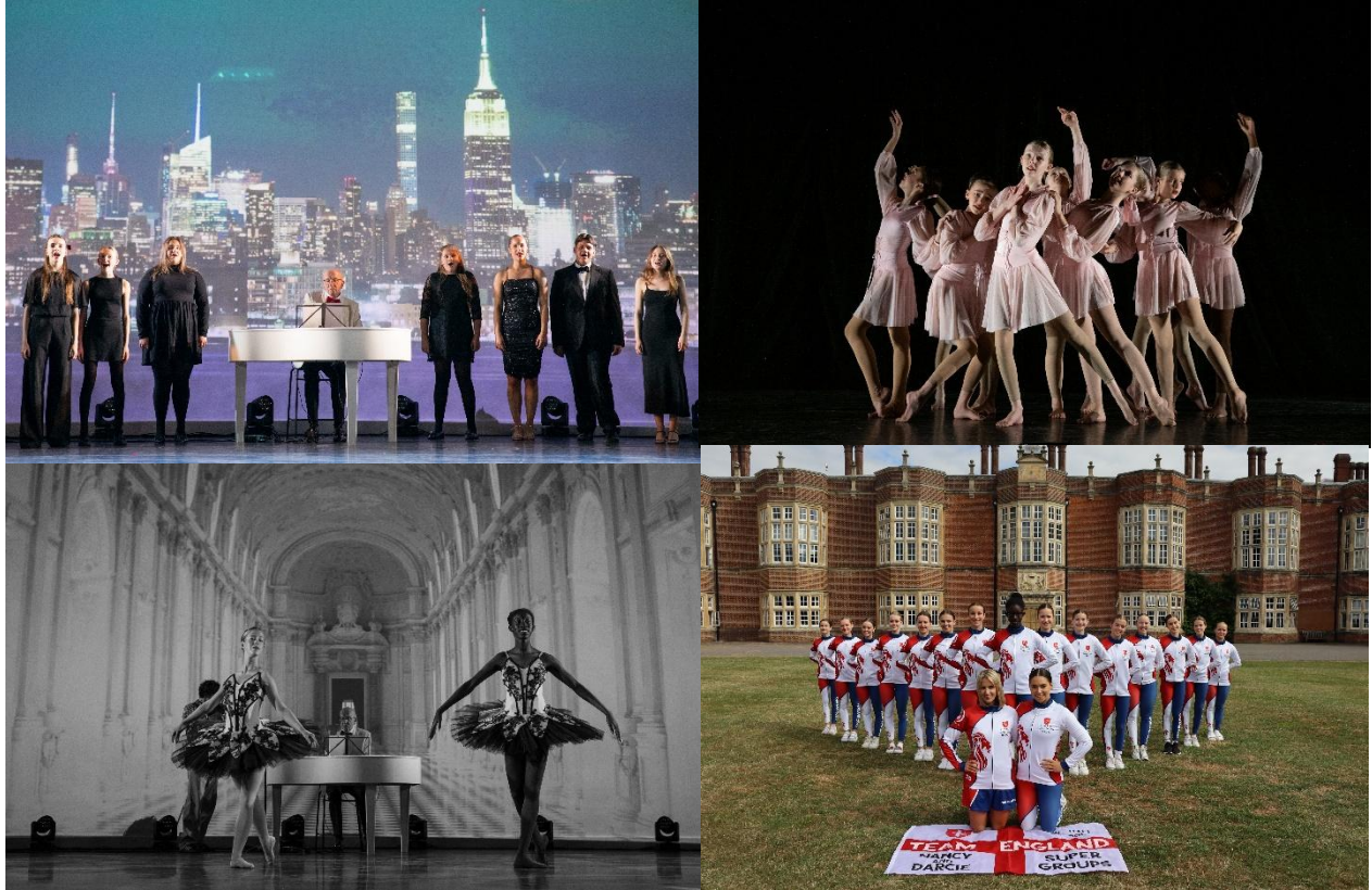
Senior Divisions Dance Show 2025 and our Dance World Cup Squad 2023

The Drama provision at New Hall is enhanced by the close working relationship between the Drama, Dance and Music Departments, all of which are located within the Walkfares Performing Arts Centre. These Departments work collaboratively to produce our productions, often allowing choreography and live music to be provided by our students, further enhancing the opportunities available. As well as Drama productions, the departments work together to produce a yearly Dance Show and a range of musical events. The School regularly reaches the finals of the Dance World Cup. We also provide Musical Theatre as part of our extensive co-curricular provision.