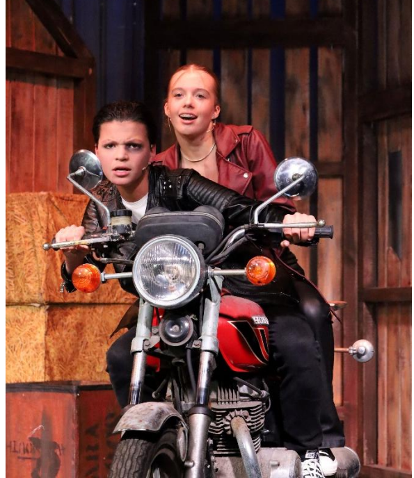
Whistle Down The Wind, 2024. Years 7-12