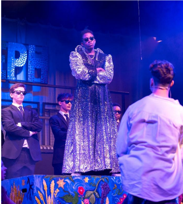
Joseph and the Amazing Technicolor Dreamcoat, 2025. Years 7-12