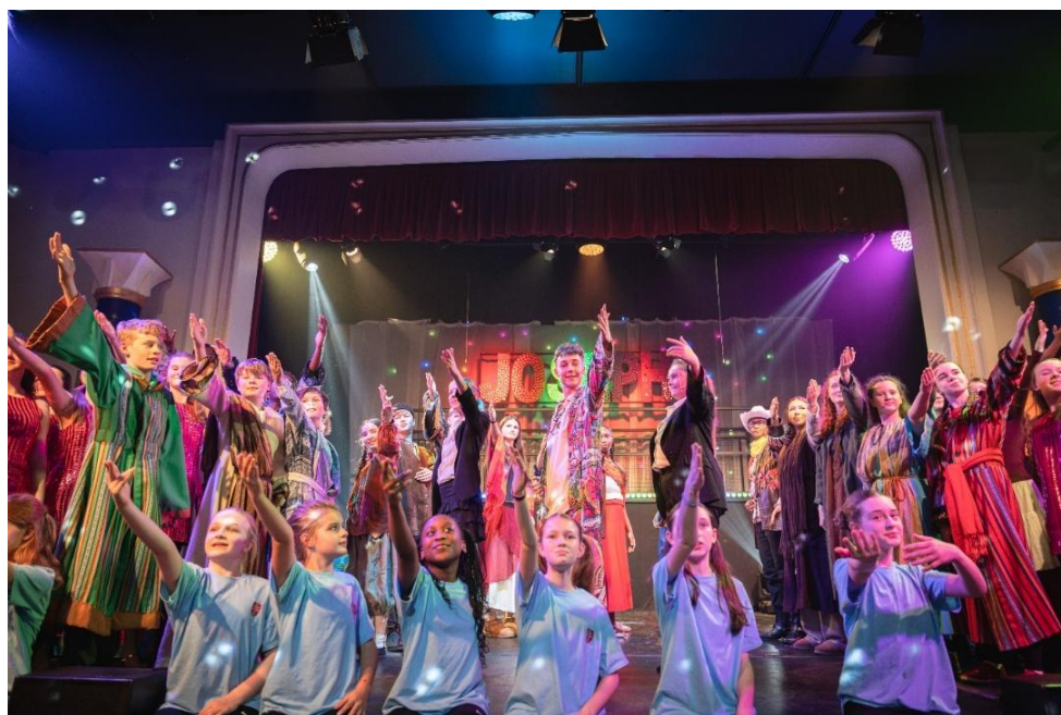
Joseph and the Amazing Technicolor Dreamcoat, 2025. Years 7-12

There is a rich heritage of Performing Arts at New Hall, and the Drama Department is vibrant, ambitious and innovative. Augustus Boal said, "Theatre is a form of knowledge; it should and can be a means of transforming society. Theatre can help build our future rather than just waiting for it."