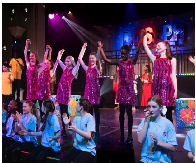
Joseph and the Amazing Technicolor Dreamcoat , 2024. Years 7-12