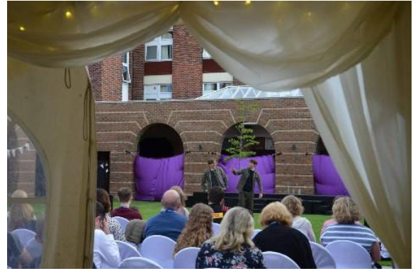
Open air theatre in our Cloisters area

At A Level, we are moving to the Edexcel Drama & Theatre specification from September 2025 and at GCSE we follow the Eduqas Drama specification. Students can be assessed in performance or design elements such as costume, lighting, sound and set design. We ensure that all students have an effective grounding in the work of a variety of practitioners, including Stanislavski, Brecht, Berkoff and Artaud. Students also experience a wide range of styles, including working with techniques used by Frantic Assembly and Complicité, Stafford-Clarke and Kneehigh Theatre.