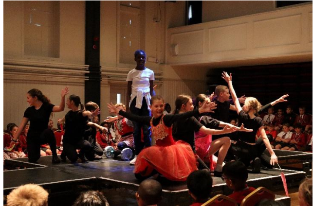
Middle Division production of Lionboy, 2024. Years 7 and 8

We share the views of Oscar Wilde who regarded theatre as, "the greatest of all art forms, the most immediate way in which a human being can share with another the sense of what it is to be a human being."