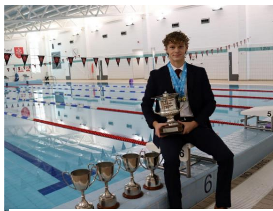
Our Senior Swim Academy Captain winning five events at the East Regional Championships