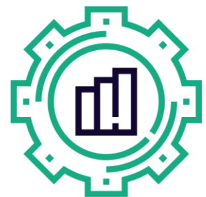
Performance Management Process